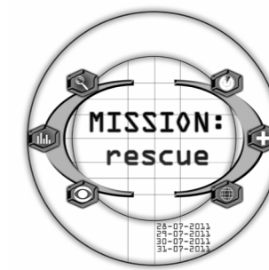
ST-MICHAEL'S HOLIDAY CLUB 2011

Spies, secret agents, enemy codes, and a life or death rescue mission... Join Special Agents M,O,S,E and Z as they try to crack the code and rediscover the most audacious rescue mission ever undertaken.