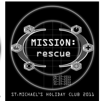
ST-MICHAEL'S HOLIDAY CLUB 2011

This is the setting for this year's Holiday Club at St Michael's. Using the latest technological wizardry, and a few egg boxes and sticky back plastic, our special agents will be tracking down clues to discover who is really telling the truth, who needs to be rescued and who will almost certainly be custard pied. We'll have the usual great mix of drama, games, music, bouncy castles and crafty creations - with a few Mission:Rescue surprises in store.